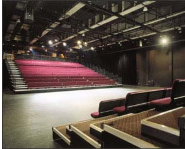
The black-lined interior of the Theatre Studio provides a neutral backdrop for experimental theatre and dance.