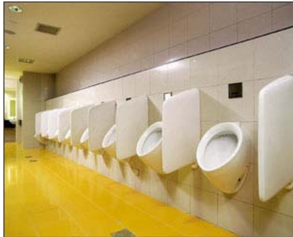
The Esplanade bathrooms feature Toto porcelain sanitary-ware, manufactured in Japan and supplied by Inhwa Marketing of Singapore. The urinal bowls feature the new Toto flush valve.

"The Esplanade passed very stringent tests conducted in the UK, France, Spain and Singapore," he says. "It was designed with versatility in mind. Seats can accommodate different recline angles and come in varying seat widths. The seating can also be adapted to the three-dimensional, bowl-shaped floor of the auditorium, which was an important feature for this project."