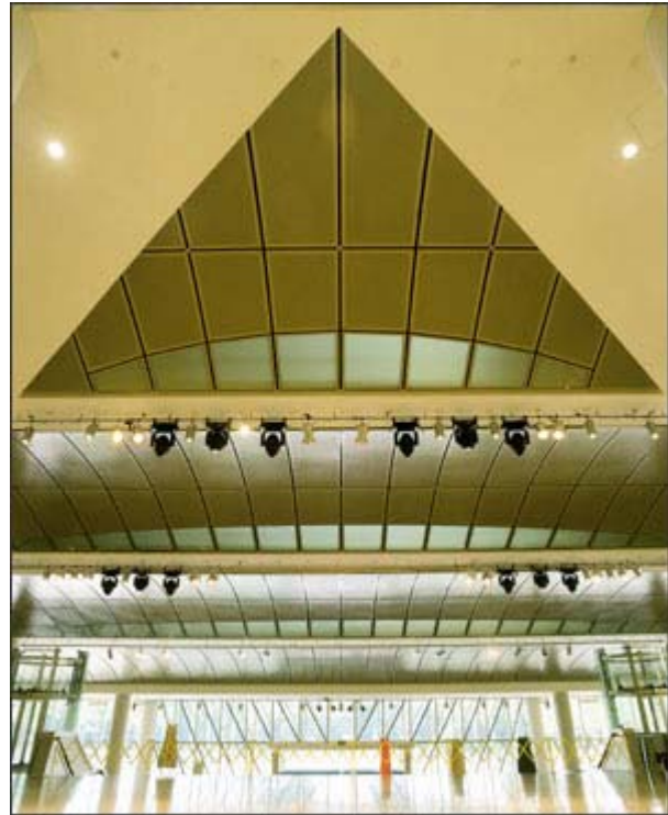
The dramatic panelled ceiling of the main lobby, was also constructed by Naa'im Holdings.