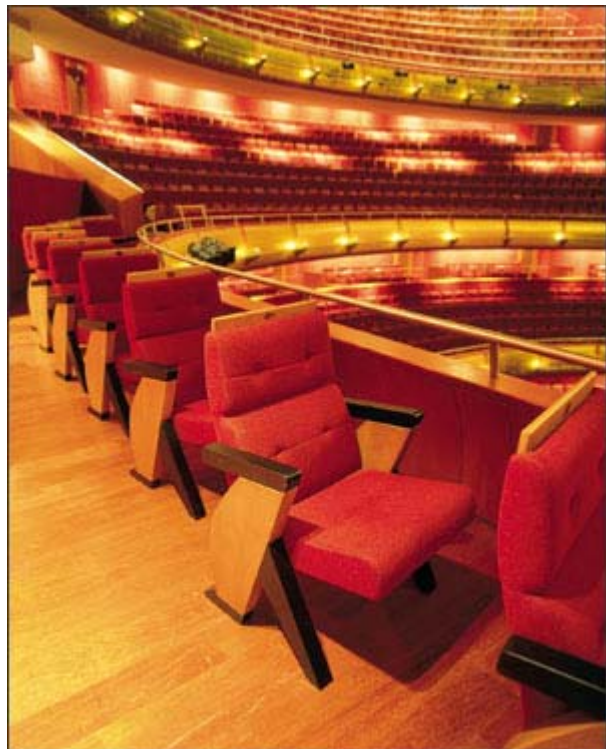
The Esplanade seating model was designed to accommodate the dish floor of the auditorium.