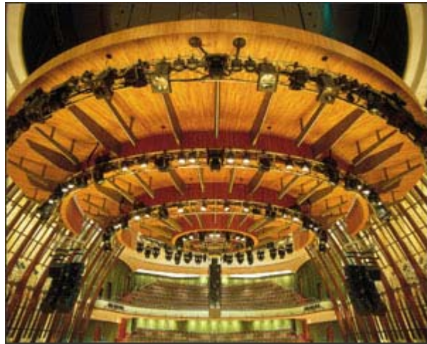
The spectacular Concert Hall canopy at The Esplanade features special effects finishes by Naa'im Holdings, the company responsible for much of the fitout.

naaim@singnet.com.sg furnisgp@singnet.com.sg enepl@enepl.com.sg