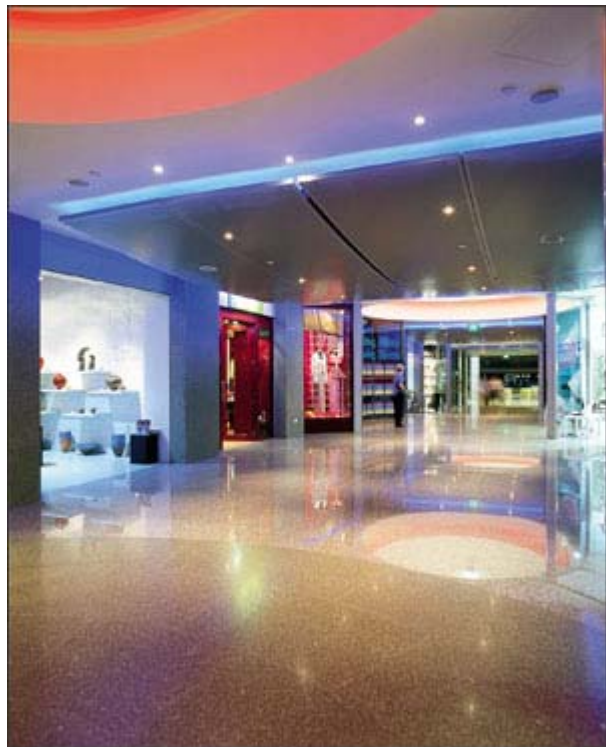
Curved ceiling panels in the commercial corridor were also built by Naa'im Holdings.