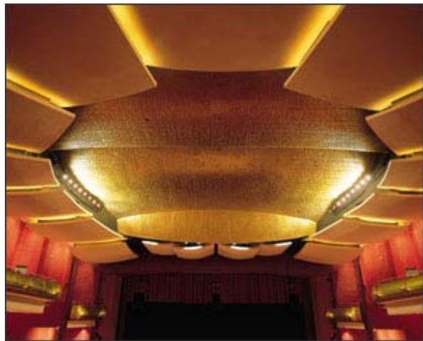
Naa'im Holdings was also responsible for the large ceiling panels in the Lyric Theatre. The moulded, fibrous glass-reinforced gypsum panels were designed to float within the ceiling space. They are supported within the space by 50 tonnes of steel.