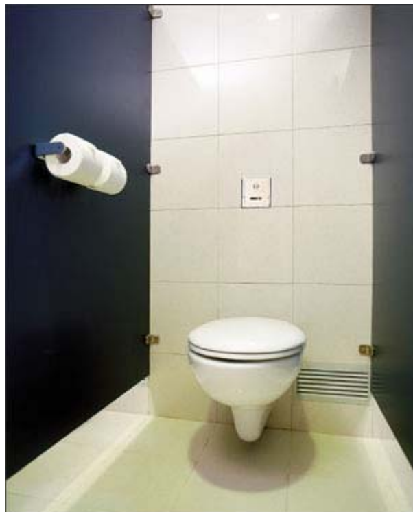
The Toto flush valve features in the wall-hung Toto toilets.