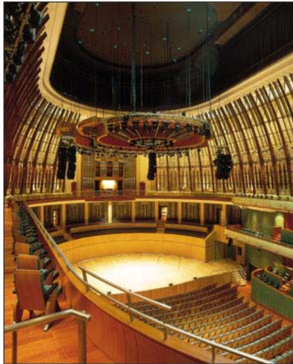
Large timber ribs were also supplied and installed by Naa'im Holdings.