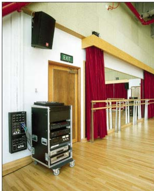
The sound system supplied and installed by E&E includes portable systems with Soundcraft mixers.