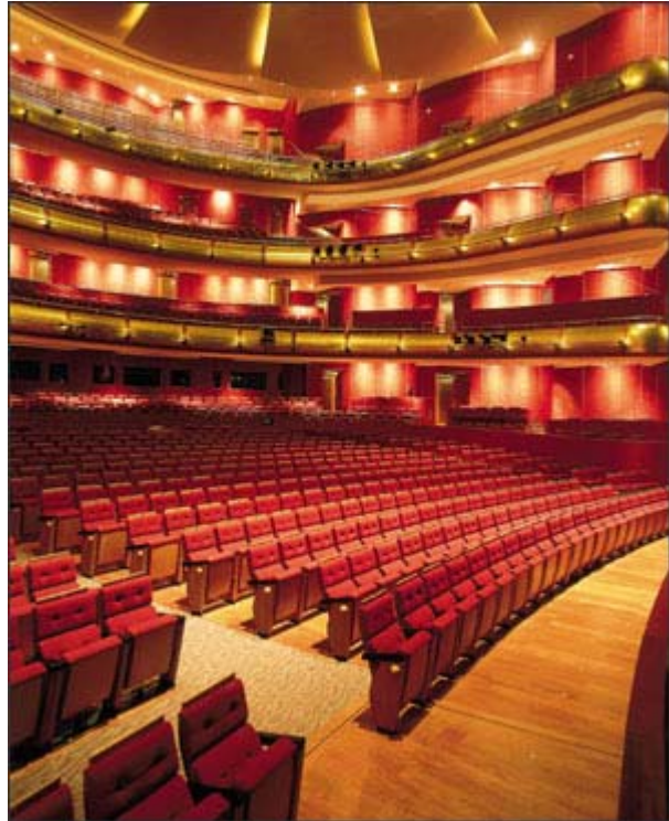
Seating for both the Lyric Theatre (shown here) and the Concert Hall was custom-designed and manufactured for The Esplanade and supplied by Furni-Sys Singapore.