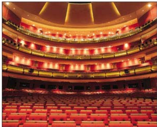
The 2000-seat theatre is spread over four levels in an intimate horseshoe shape, and houses Singapore's largest performing stage. The stage platform incorporates two full-sized stages, which facilitate swift scene changes.