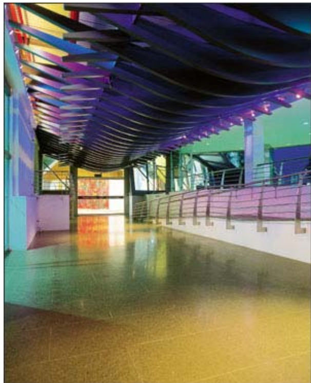
The foyer of the Theatre Studio features a boomerang-shaped ceiling, constructed by Naa'im Holdings. The ribbed structure is floodlit at night.