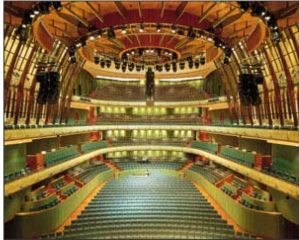
The Concert Hall can seat 1800 people.