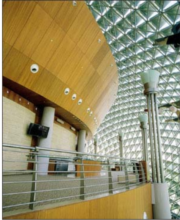
Timber finishes by Naa'im Holdings are a feature of the public spaces.