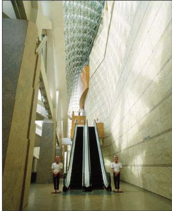
Otis also supplied and installed 18 escalators.