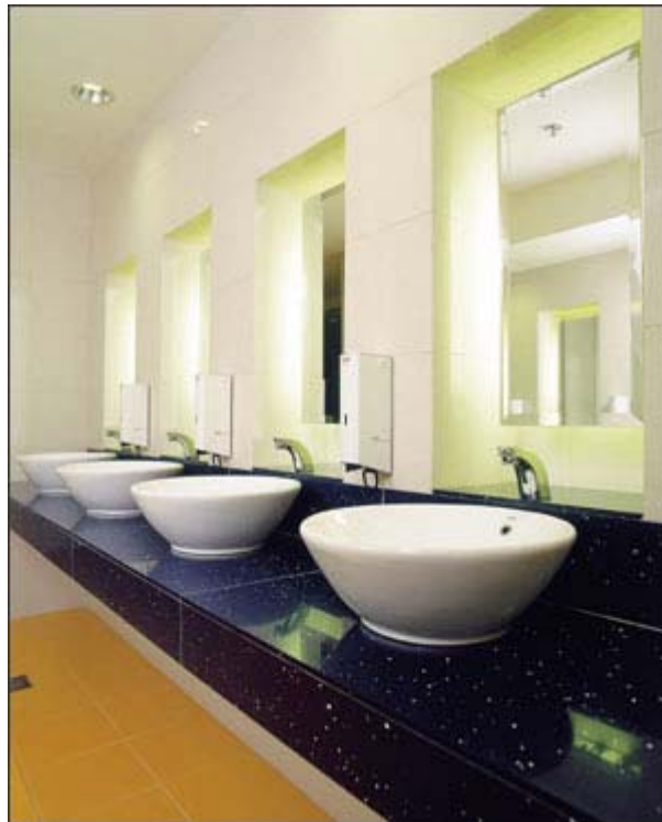
Toto wash basins reflect the current trend towards vessel bowls.